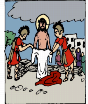
10. Jesus is stripped of His clothing