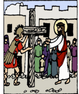
2. Jesus takes up His cross