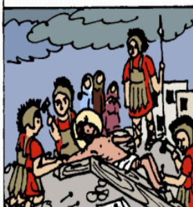
11. Jesus is nailed to the cross