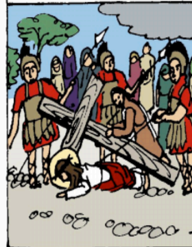
9. Jesus falls the third time