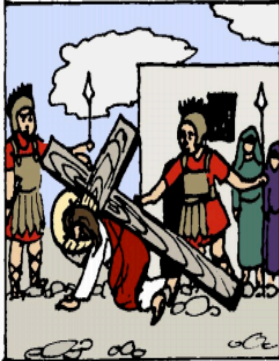
3. Jesus falls the first time