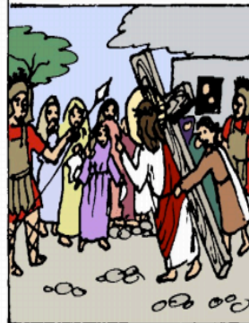
8. Jesus speaks to the women of Jerusalem