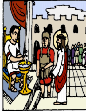
1. Jesus is condemned to death