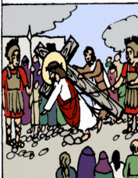
7. Jesus falls the second time