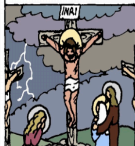
12. Jesus dies on the cross