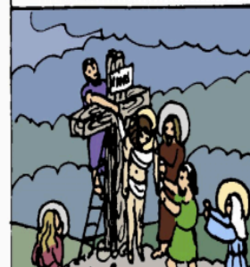
13. Jesus is taken down from the cross