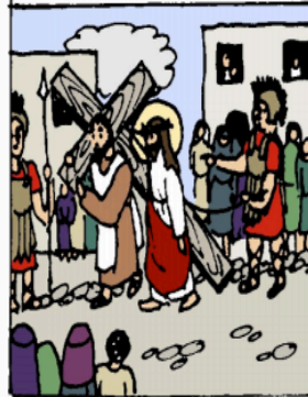
5. Simon helps Jesus carry the cross