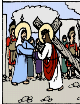
4. Jesus meets His mother