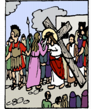
6. Veronica wipes the face of Jesus